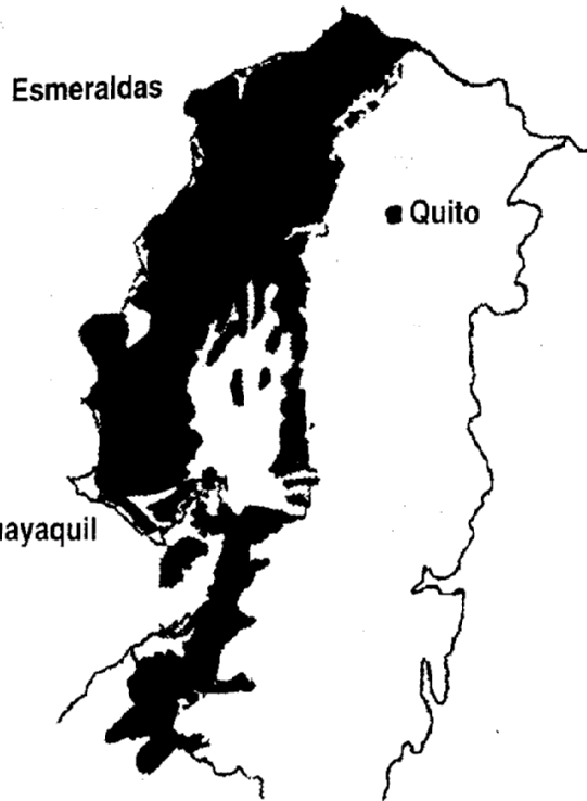
Cobertura boscosa en 1938